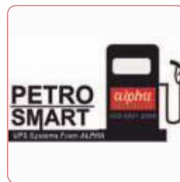
UPS SYSTEM FOR PETROL PUMPS