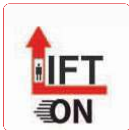
UPS SYSTEM FOR LIFTS