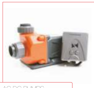
AC DC PUMPS