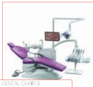
DENTAL CHAIR & COMPRESSORS